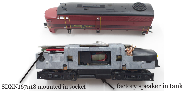
Figure 2: Atlas N-FA1, SDXN167n18 decoder installed