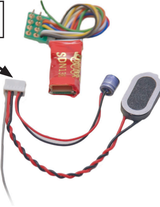
Figure 2: Installing the PX112-6 Power Xtender