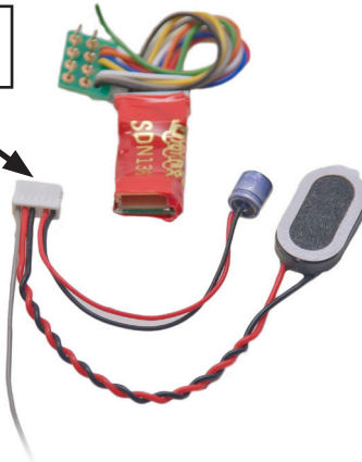
Figure 2: Installing the PX112-6 Power Xtender