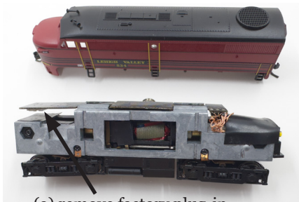
(a) remove factory plug-in