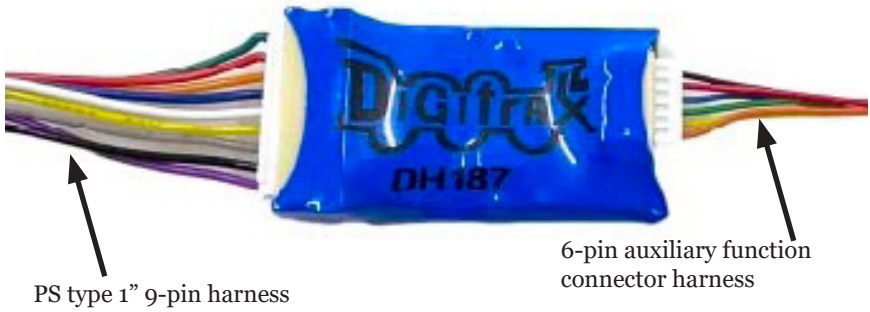
Figure 1: DH187PS Decoder showing 9-pin Track/Motor, Function harness, 6-pin auxiliary function harness.