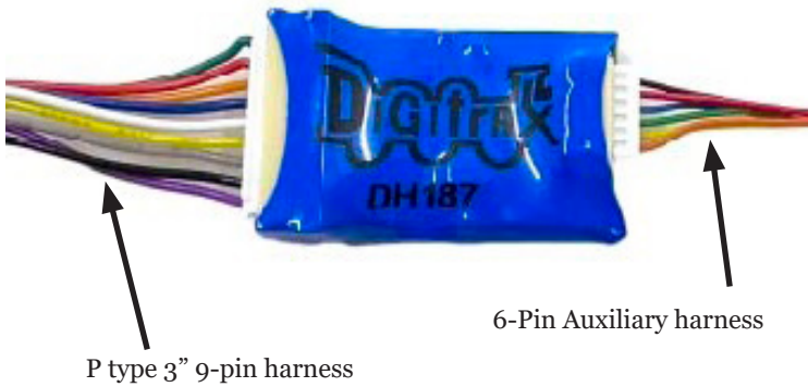
Figure 1: DH187P Decoder showing 9-pin Track/Motor, Function harness, 6-pin auxiliary function harness.