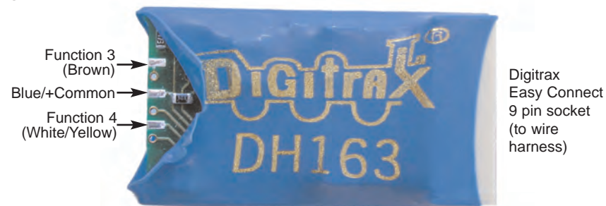
Figure 2. DH163PS Decoder Function Outputs